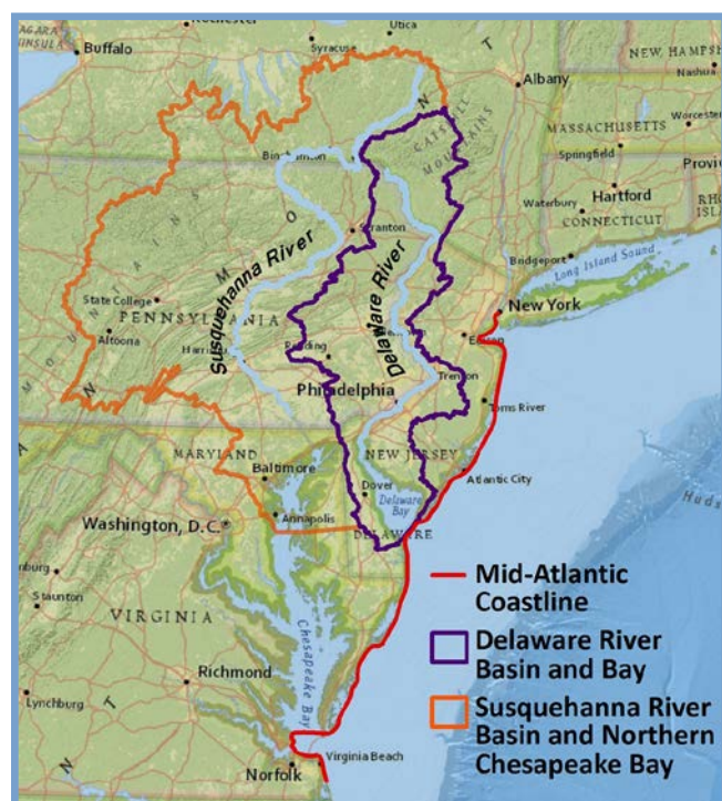
ICoM's mid-Atlantic study region.

The U.S. Department of Energy's (DOE's) Integrated Coastal Modeling (ICoM) project is designed to develop, evaluate, and apply a range of modeling tools to systematically analyze coastal processes, hazards, and responses. The ICoM team is a multi-institutional partnership led by Pacific Northwest National Laboratory with broad expertise in modeling human and natural systems and evaluating coastal risks.