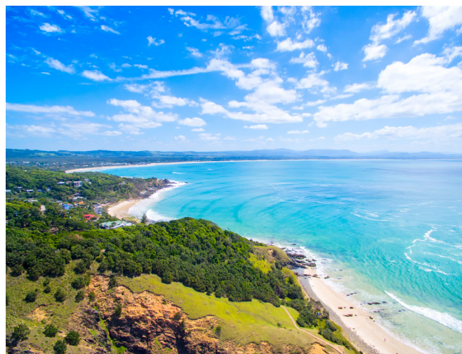
The CANGA project is exploring a new technique to incorporate atmosphere, ocean, land and ice model components with earth system models to better use high-performance computing architectures.

At the same time, scientists are adding more processes, such as river biogeochemistry and cloud updrafts, and more components, such as dynamic ice sheets, to the coupled Earth system to better represent the many interacting elements. To manage this complexity and provide more parallelism to utilize advanced